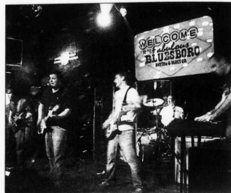
The Compromise rock the Bluesboro crowd. In addition to the next show at Bluesboro on Nov. 3, the band will play at The Rutledge in Nashville on Oct. 19 with The Easy Kill and Pavilion.