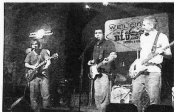
The Compromise chat with the audience during a recent show at the Bluesboro Rhythm & Blues Club in Murfreesboro. Their next Bluesboro show is Nov. 3.

Recently, they recorded and released their debut album "Teen Movie Soundtrack." With a total of 10 songs on the album, The Compromise has managed to create the per-