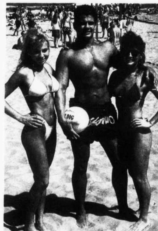
The South Padre Island Convention and Visitors Bureau