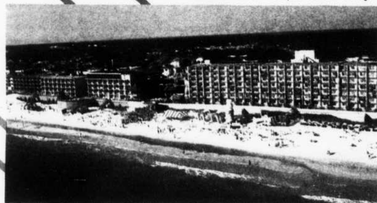
Ramada and Days Inn, Panama City Beach

One of the best things about spending Spring Break at Panama City Beach is—believe it or not—the police. You can party on the beach and the local cops are really