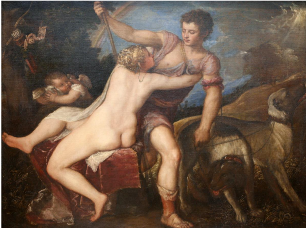
Figure 2. Venus and Adonis by Titian, 1553.

presence of l'animot in the poem, interpreting the horses as just another indicator of Venus's affinity with nature is certainly valid. However, the stark differences between the horses suggest the necessity for more critical attention. Comparative literary scholars could delve deeper into the relationship between Venus and Adonis, and the two horses.