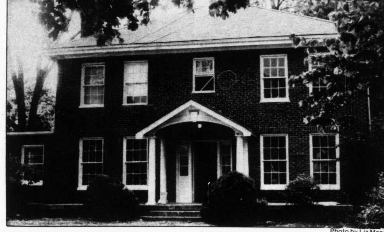
Pi Kappa Alpha fraternity has transferred to new digs (above) at 715 North Tennessee Blvd., are, to a man, happy about the move. One Pike went so far as to call the new abode "swell."

they will again be trend-setters. "The house will be open to everyone on campus this fall