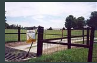
The entrance to 1 of the 1,566 Century Farms in Tennessee.