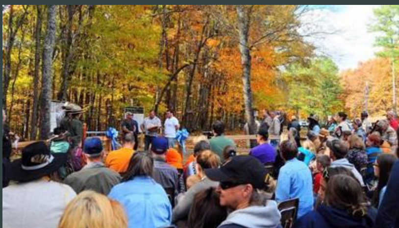
The grand opening of the Trail of Tears Retracement Hiking Trail at the David Crockett State Park on November 2.

Be sure to check out our website for new lesson plans on Manifest Destiny, views of Christopher Columbus & scientific inventions, as well as newsletters on the topics of disabilities, economics, westward migration & recreation & leisure. To see our recent work, find us on Facebook .