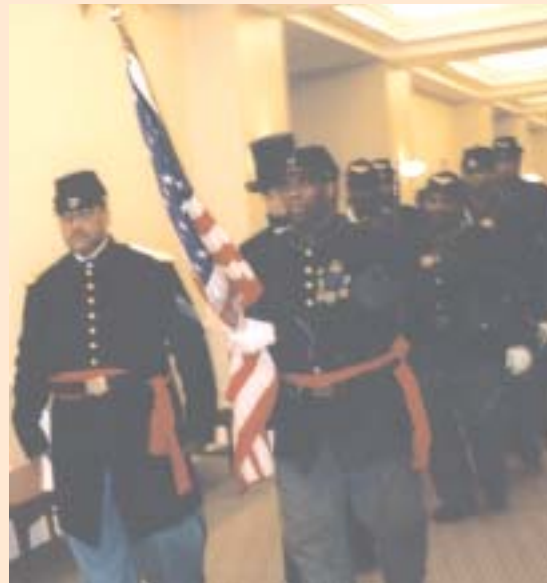
Members of the 13th U.S.C.T. Infantry Color Guard present the colors at the Battle of Nashville 140th Anniversary Symposium.

Battle of Nashville 140th Anniversary Symposium December 10–11, 2004 Nashville Public Library See www.tennesseehistory.org for more information.