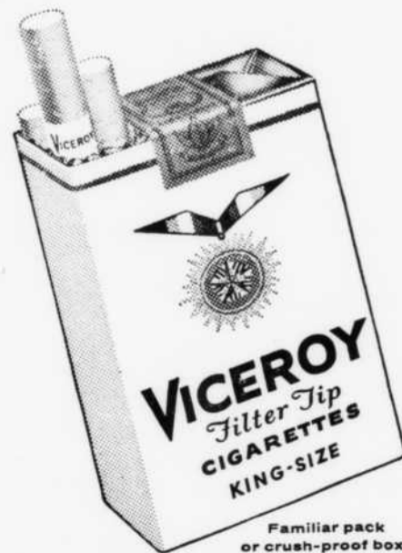
Familiar pack or crush-proof box.

*If you checked (B) in three out of four of these questions, you're a pretty smart cooky—but if you checked (C), you think for yourself!