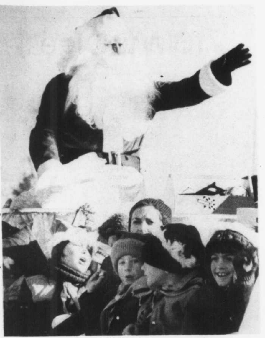
Children's faces warmed the cold air Sunday during the Murfreesboro Christmas parade as Santa Claus came to town.