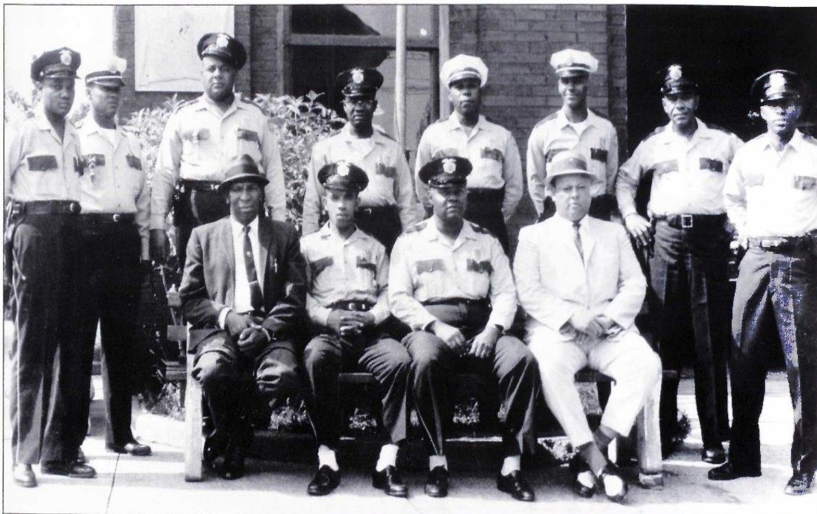
A group of Knoxville black police officers during the modern era in 1960. (pg 370, Tennessee Lawman: History of the Men and Women Behind the Badge. )